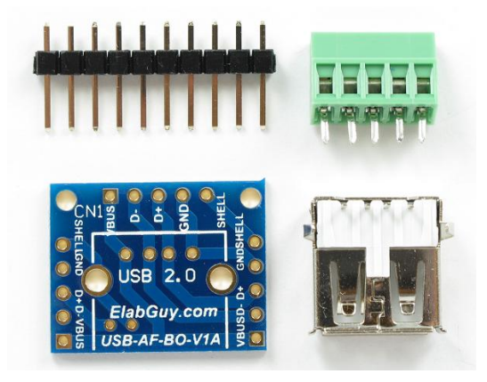
Figure 1: Parts inside the kit Note: the module is not assembled, user can decide which connector to use on the module.